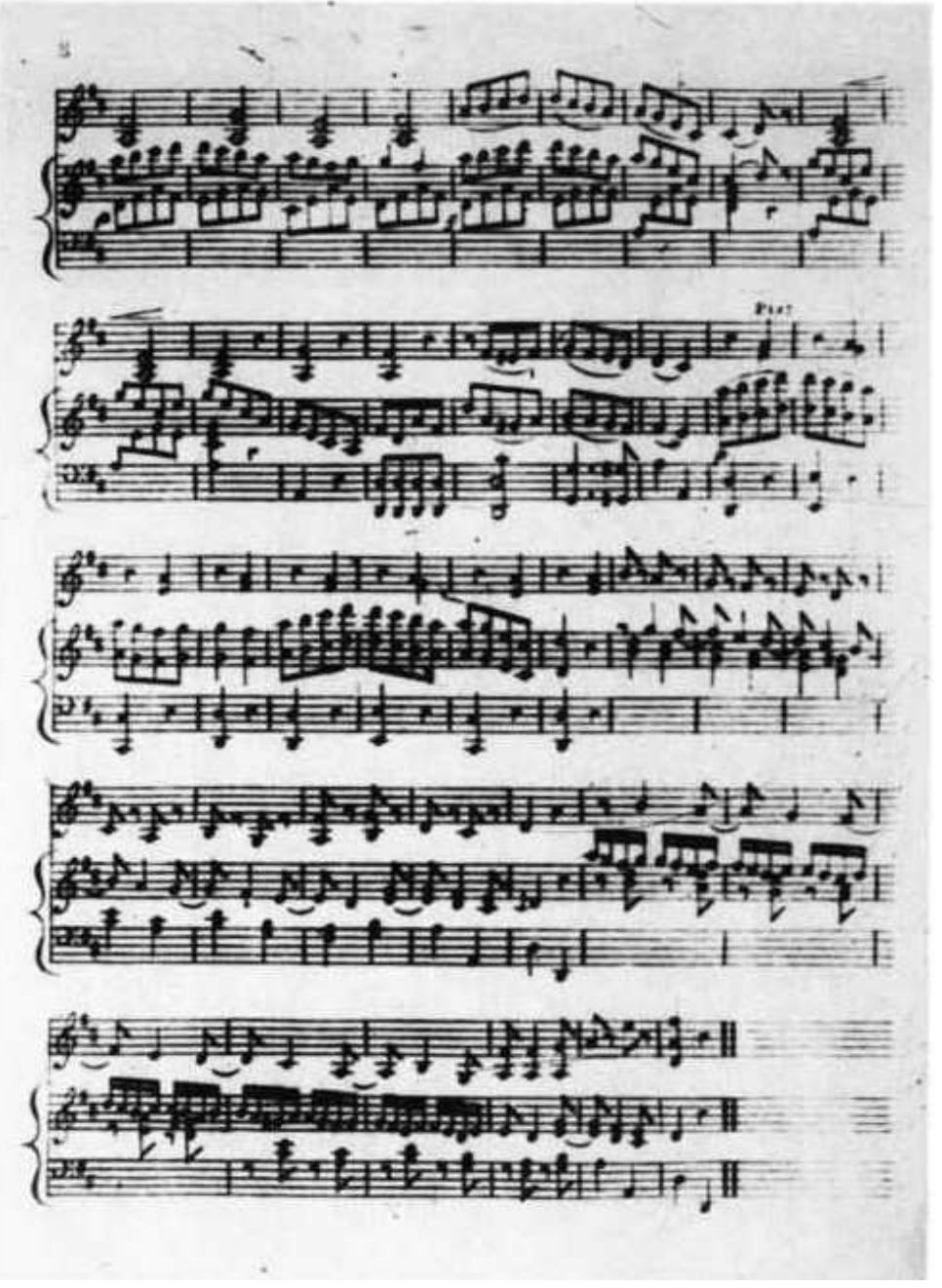
Facs. 5, 6: Sonata in D KV<sup>6</sup> deest: first and last pages of the print by J. Bland (London, c. 1780). Copy: Českỳ Krumlov (Krumau).