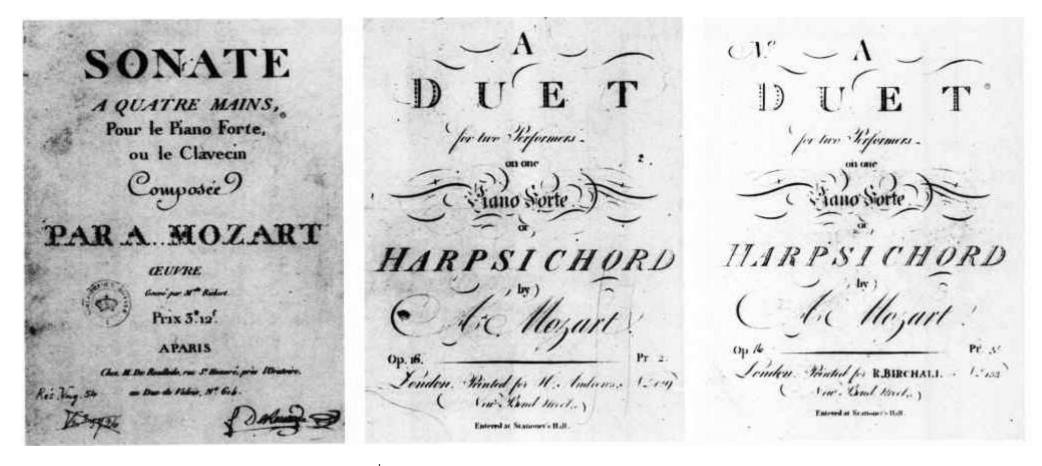
Facs. 7, 8, 9: Sonata in C for Piano four hands KV 19 <sup>d</sup>: The title pages of the printed editions by De Roullede (Paris, c. 1787/88), H. Andrews (London, c. 1789) and R. Birchall (London, 1797). Copies: see p. XVI